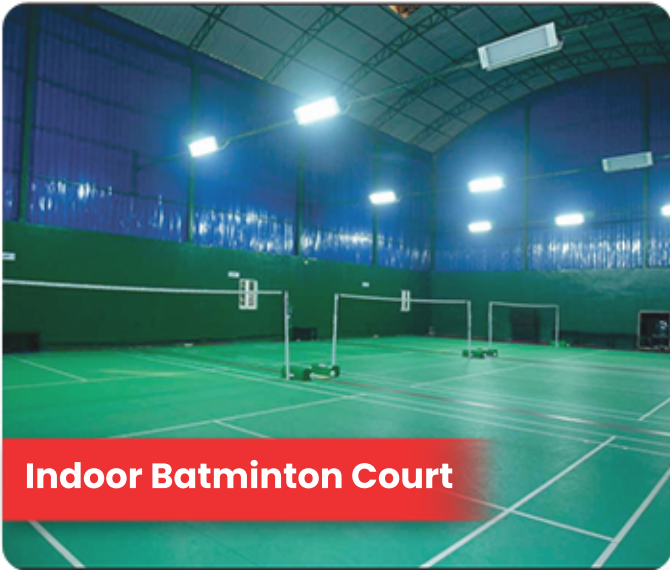
Indoor Badminton Court