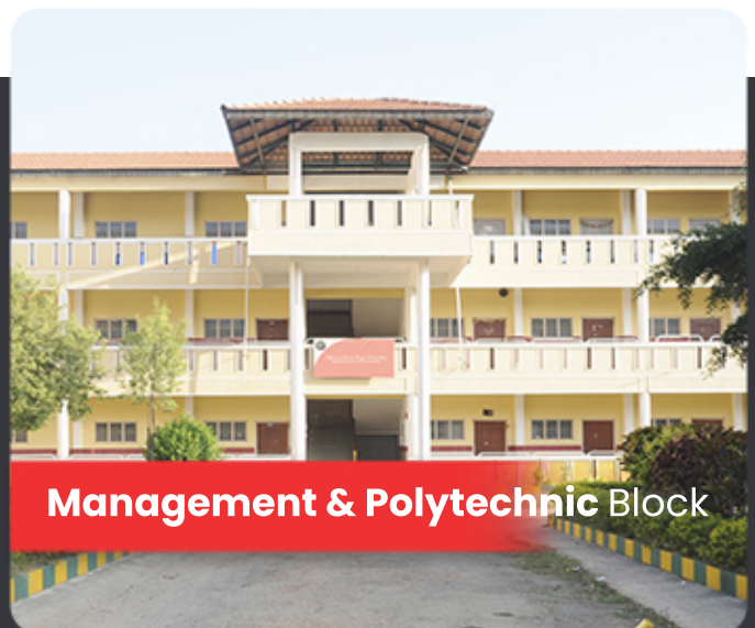
Management & Polytechnic Block