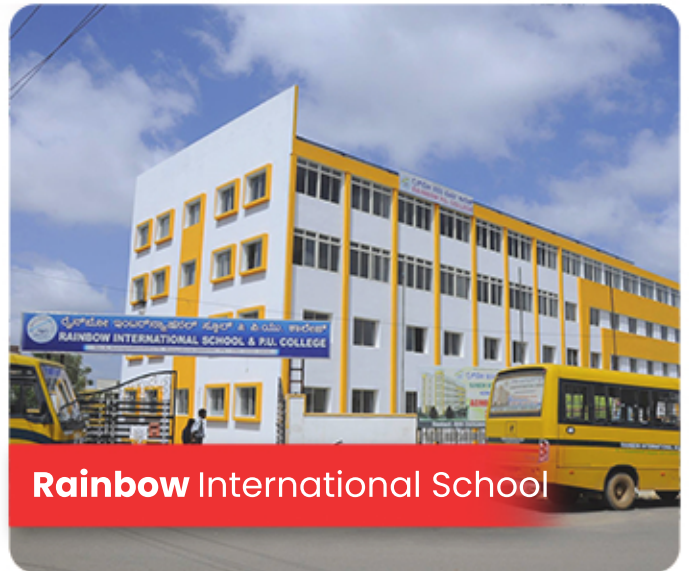
Rainbow International School