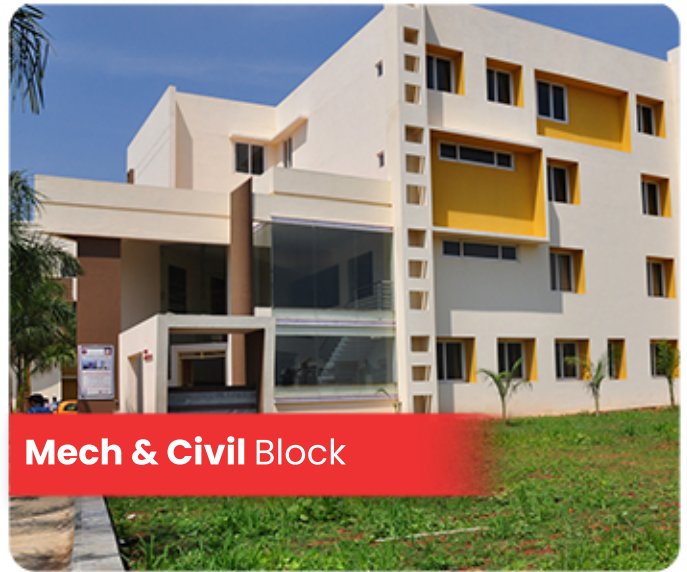
Mech & Civil Block