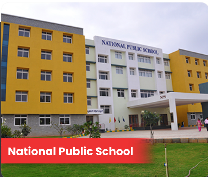
National Public School